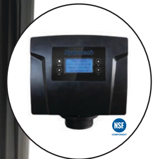
Brine Tank Include